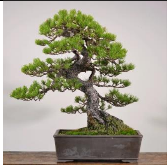
Shore Pine with a trunk girth half the depth of the pot – a good year-round growing pot.