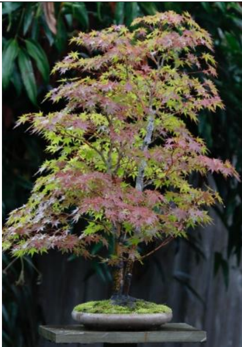
A Japanese Maple 'Beni-kawa' in a shallow pot (This is an oval pot. Photographed from the side) Maples grow well in shallow pots year-round.