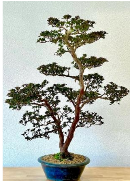
Skinny trunked azalea in a deep pot