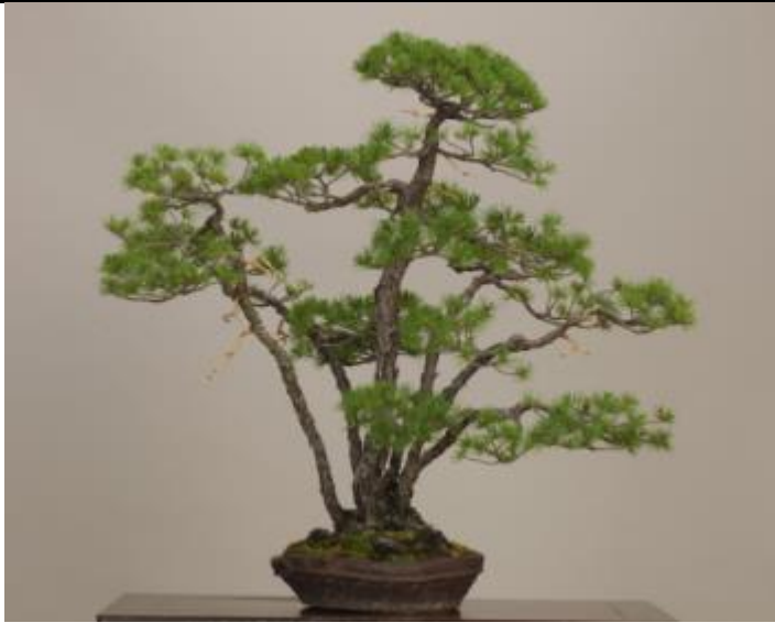
This Japanese White Pine bunjin is mounded. This adds additional depth to a pot already twice as deep as the thickest trunk. Pines are happiest in deeper pots.