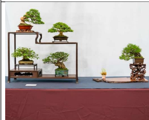
5-tree display by Brian Hollowell

pictures in bottom row are the individual sections from the picture below them