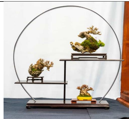
Right hand display stand