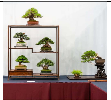
6-tree display by Melvyn Goldstein

pictures in bottom row are the individual sections from the picture below them