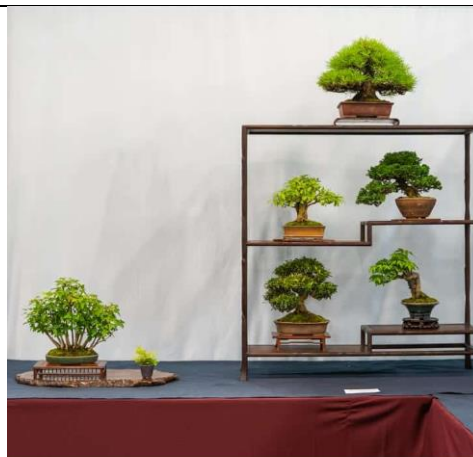
6-tree display by Gary Andes