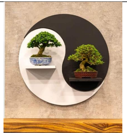
2-tree display by Pedro Morales