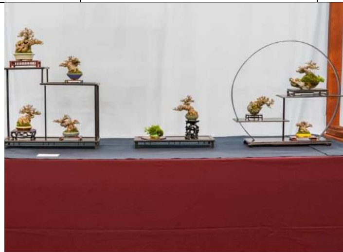
Awesome 8-tree mini bonsai display by Suthin Sukosolvisit