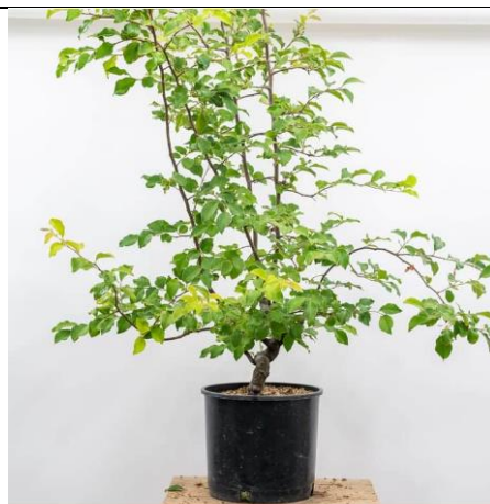
Seven-year old Chinese quince

The trunk is close to desired thickness so I removed several of the sacrifice branches, but left one to maintain the tree's vigor for the rest of the growing season