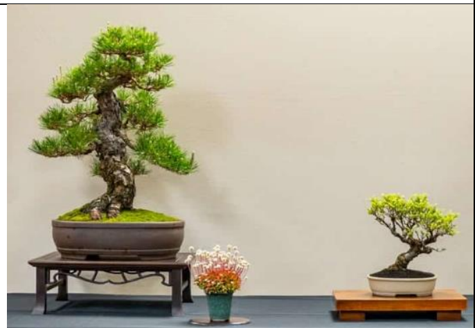
Maple to left and Black Pine above at the event