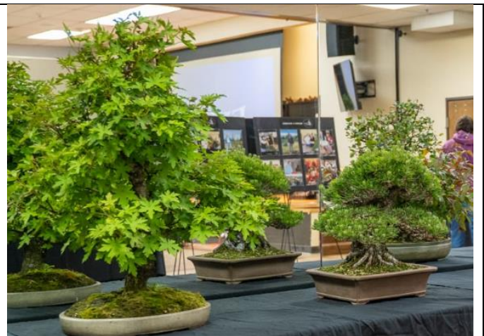
Liquidambar and black pine at the event