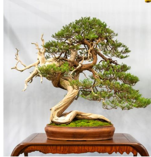
Rocky Mountain juniper

I hope you enjoyed this brief tour of the US National Exhibition! If you're interested in seeing all of the trees on display at the exhibition, you can order the exhibit catalog from International Bonsai .