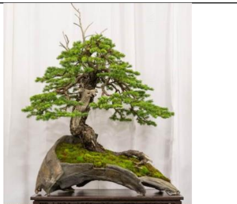
Colorado blue spruce by Thomas Ungrey