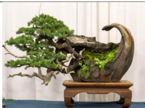
Colorado Blue Spruce – container by Erik Kyizovensky