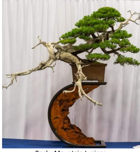
Rocky Mountain Juniper