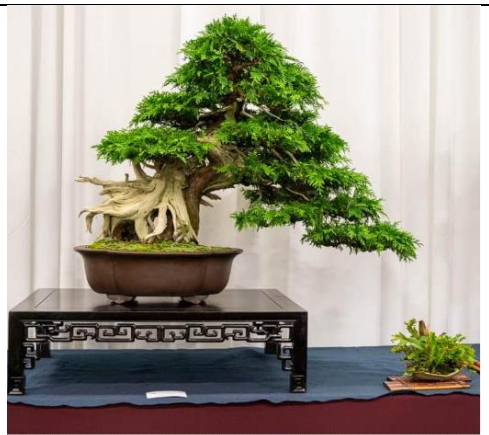
Eastern white cedar by Suthin Sukosolvisit