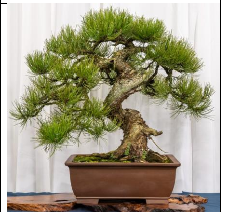
Ponderosa Pine