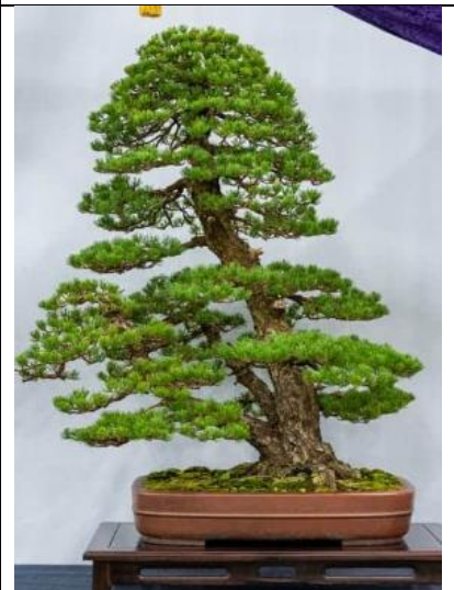
White pine