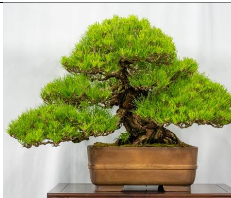
Japanese black pine by Brownlee Currey