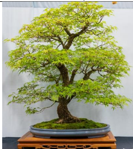
Arakawa Japanese maple by Lucas Glass