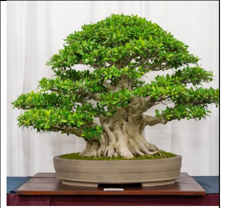
Banyan - Ficus microcarpa